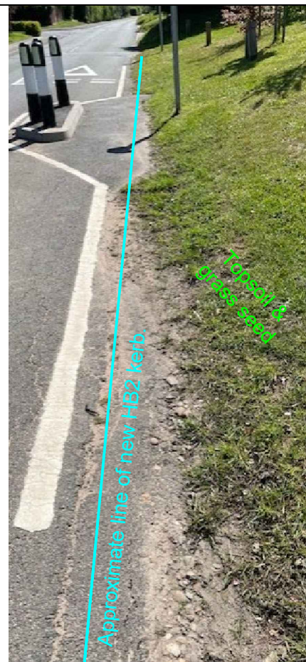
A view looking south towards the existing build-out..

These two images are from the same locale. Just showing the end detail where the HB2 kerb is to commence. Remove dropper from start point '0' and replace with new one at far end (left) at the 48.4m point. HB2 kerbs in between.